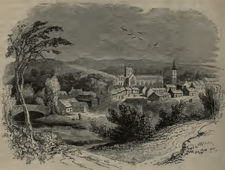
JEDWORTH. (Jedburgh.) From an Original Drawing.

all their forces at a castle called Jedworth, situated amidst deep forests and on the borders of Cumberland. Having arranged everything concerning this business, they separated, but never mentioned one word of their intentions to the king; for they said among themselves, he knew nothing about war. On the appointed day, earl James Douglas first arrived at Jedworth: then came John earl of Moray, the earl of March and Dunbar, William, earl of Fife, John earl of Sutherland, Stephen earl of Menteith*, William earl of Mar, sir Archibald Douglas, sir Robert Erskine, sir Malcolm Drummond, sir William and sir James Lindsay, sir Thomas Berry, sir Alexander Lindsay, sir John Swinton of Swinton, sir John de Sandelans, sir Patrick Dunbar, sir John Sinclair, sir Walter Sinclair, sir Patrick Hepburn, sir John Montgomery, sir John his son, and his two sons; sir John Maxwell, sir Adam Glendinning, sir William de Redurint, sir William Stuart, sir John Halliburton, sir John de Ludie, and sir Robert Lauder, sir Stephen Frazer, sir Alexander and sir John Ramsay, sir William of North Berwick, sir Robert Hart, sir William Wardlaw, sir John Armstrong, David Fleming, Robert Campbell, with numbers of other knights and squires of Scotland.